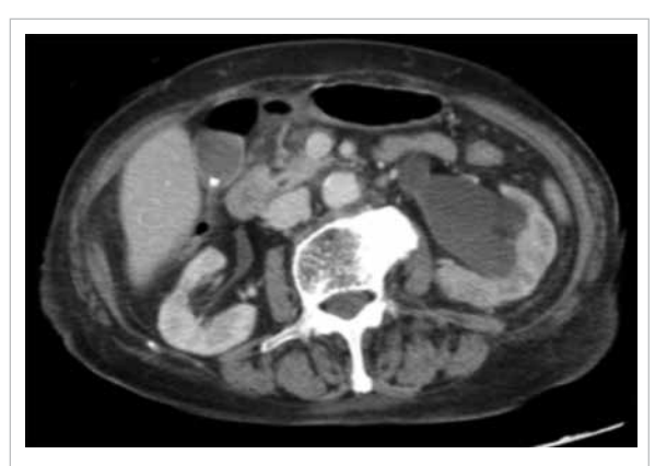
FIG I. Axial computed tomography image showing left hydronephrosis

Blood and urine cultures grew Escherichia coli . The patient recovered gradually with a 2-week course of antibiotics. The double-J stent was removed at the end of March (2 months after stent insertion). However, she developed another episode of urosepsis shortly afterwards and a double-J stent was re-inserted. She remained well with regular revision of double-J stent.