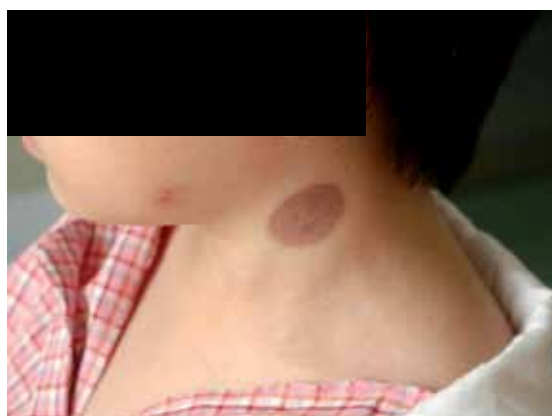
FIG 2. Fixed drug eruption due to ibuprofen

SNIUAA. A negative skin prick test, however, does not exclude hypersensitivity to APs as many reactions are non-IgE-mediated. Moreover, with the passage of time, even individuals with IgE-mediated hypersensitivity may lose skin test positivity. An intradermal test and atopic patch test may be