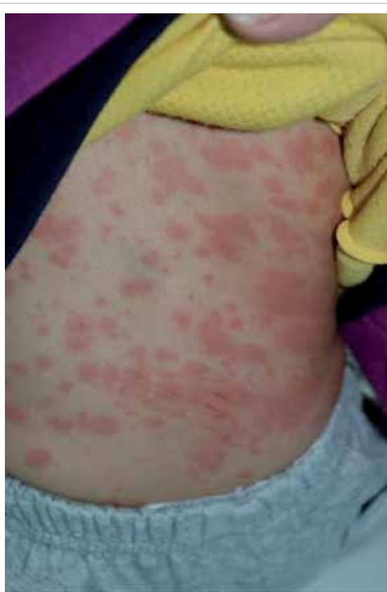
FIG 1. Maculopapular rash due to sensitivity to non-steroidal anti-inflammatory drugs

Aside from diagnosis of allergy to an aeroallergen in patients with NERD, the skin prick test for AP is probably useful only in the context of IgE-mediated