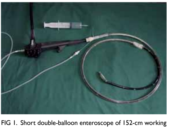
length (EC-450BI5, Fujifilm endoscopy)

A 76-year-old man was admitted to our hospital in December 2015 with acute cholangitis that presented as fever and deranged liver function tests (LFT) with predominant elevation of alkaline phosphatase