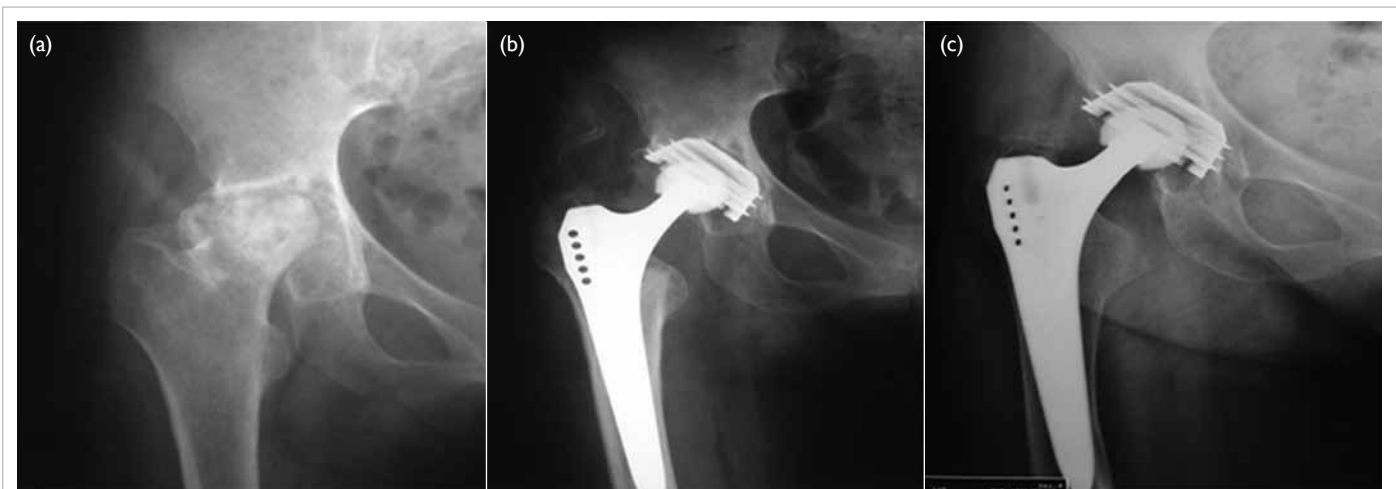
FIG 3. An example of good outcome with Zweymüller-Plus total hip arthroplasty

Non-progressive radiolucent lines of <2 mm