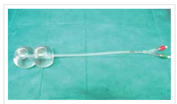
FIG I. Double balloon catheter

Inclusion criteria were women with one lower transverse caesarean scar and no contra-indication for VBAC who were given the option of either repeated elective CS or VBAC. Those VBAC cases requiring medically or obstetrically indicated IOL