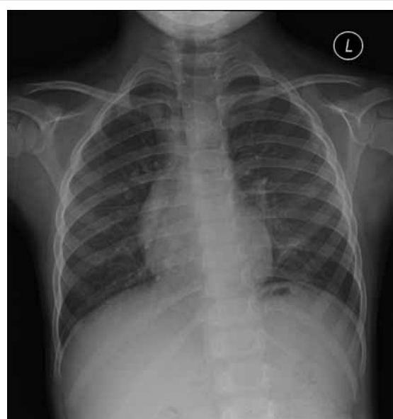
FIG 2. A chest X-ray performed after 3 months of prednisolone therapy showing improvement in reticulonodular densities