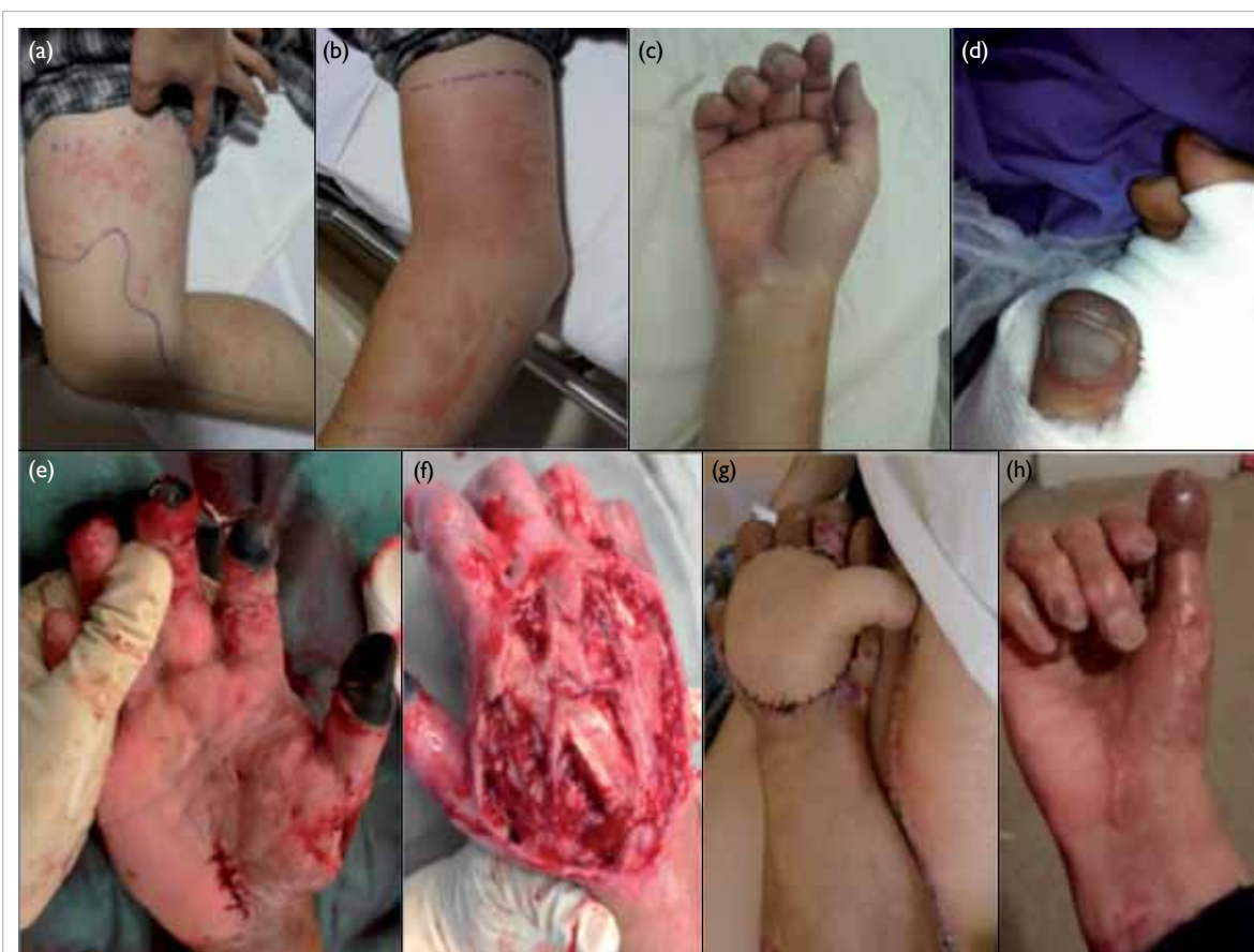
FIG 1. Serial photos showing progressive digital gangrene and large skin defect after repeated debridement

Typical lesion after jellyfish sting over (a) right thigh, (b) elbow, and (c) hand on day 2 after injury: linear; papular whip-like dermatitis ('tentacle print'). (d) Finger tip with cyanotic changes on day 8 after injury. (e) Well-demarcated gangrenous change over finger tips on day 15 after injury. (f) Extensive skin defect with expose tendon after debridement on day 17 after injury. (g) Reconstruction included a two-stage operation with groin flap to cover the dorsum of hand and a second groin flap to cover gangrene tip (6 weeks after injury). (h) Outcome (attempt to make tight fist) after multiple major reconstruction (8 months after injury)