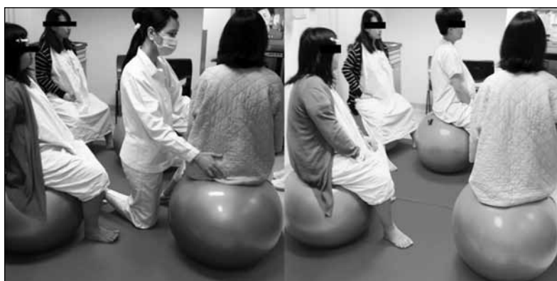
FIG 2. A physiotherapist teaching birth ball exercise in labour ward