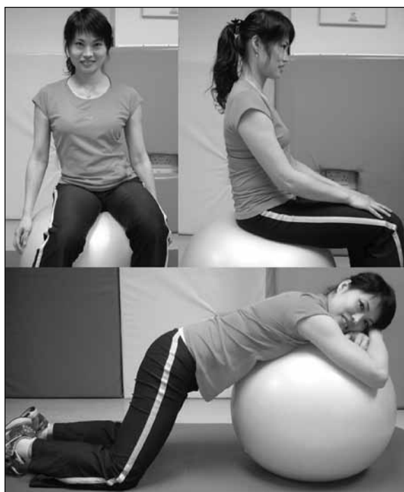
FIG 1. Types of birth ball exercises taught in labour ward

After 30 minutes of birth ball exercises, the physiotherapists reassessed the women's condition by determining labour pain intensity, back pain intensity, frequency of labour pains, stress and anxiety levels, and the subjective pressure level over the lower abdomen. The woman's satisfaction level was indicated using the VAS score after the session. The dosage of pethidine used in the labour process was recorded by midwives.