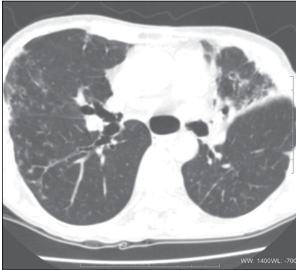
FIG 3. Computed tomography of the thorax reveals bronchiectasis, with centrilobular nodules in a tree-in-bud pattern at the right middle and lower lobes and the lingular segment, suggesting active endobronchial sepsis