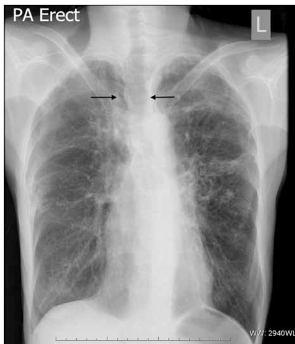
FIG 1. A chest radiograph shows a prominent trachea, with an irregular outline (arrows). Bilaterally, the lung field yields increased reticulonodular changes, suspicious of infective changes

Kuhn syndrome. Bronchioalveolar lavage yielded Mycobacterium chelonae . The patient began anti-tuberculous treatment and her symptoms gradually improved.