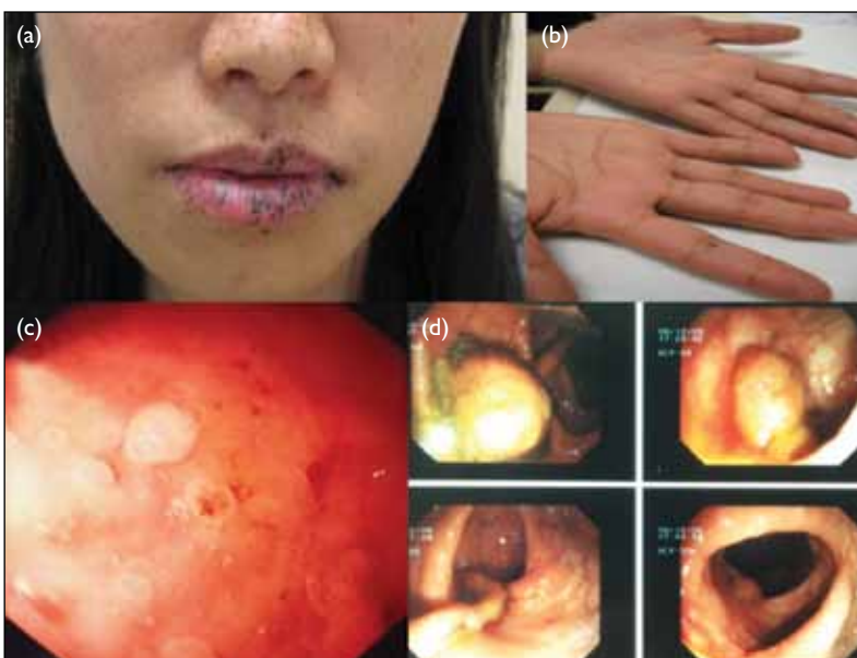
FIG 1. Clinical presentation of the patient

Endoscopic polypectomy should be performed for polyps larger than 1 cm. Large small intestinal polyps can be removed by balloon enteroscopy or sometimes surgery. Although no pharmacological treatment or prophylaxis is recommended for PJS,