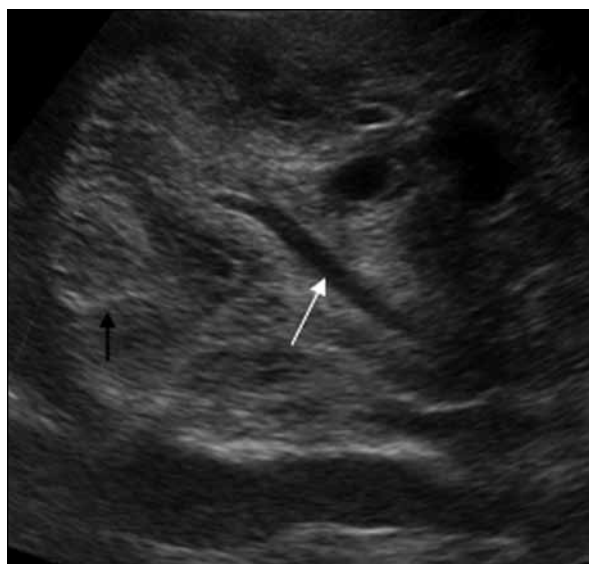
FIG 1. Grey-scale trasabdominal ultrasound (transverse scan) showing mosaic pattern/tortoise-shell pattern of hepatic schistosomiasis. Note the multiple thickened echogenic septa (black arrow) outlining polygonal areas of relatively normal-appearing liver parenchyma, and the portal vein (white arrow) surrounded by echogenic periportal fibrosis

Typical sonographic appearances include hepatomegaly with an irregular contour and a mosaic/tortoise-shell pattern of liver echotexture, characterised by multiple thickened echogenic septa outlining polygonal areas of normal-appearing liver parenchyma. 2 Periportal fibrosis is another feature and manifests as thickened walls of portal venules also known as 'clay-pipestem fibrosis'. Ultrasonography reveals as an anechoic portal vein surrounded by an echogenic mantle of fibrous tissue. Findings consistent with complications (portal hypertension and cirrhosis) may also be present. Similar imaging