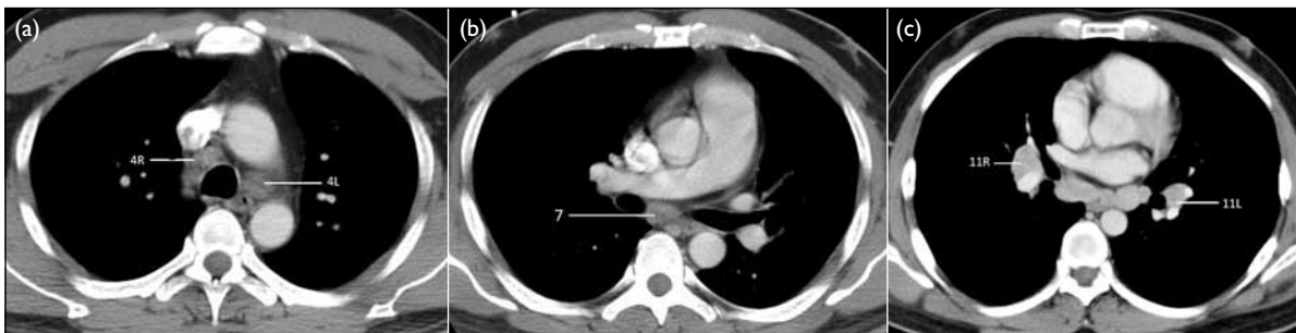
FIG 1. Computed tomographic scans of the typical location of lymph nodes sampled by endobronchial ultrasound-guided transbronchial needle aspiration

for 59% and 61% of all such sampling, respectively (Fig 1). 9 The size of the lymph nodes sampled had a mean diameter of 1.36 cm (SD, 0.61 cm). Before their EBUS-TBNA procedure, results from PET were only available in 122 (45%) of the patients. Among the group with non-diagnostic EBUS-TBNA findings, there were 30 patients who underwent subsequent surgical exploration, and three had a second EBUS-TBNA. The remaining 60 patients were clinically followed up only. Among the latter, there were 33 with no evidence of malignancy during a mean follow-up duration of 1.7 (SD, 1.3) years (Fig 2).