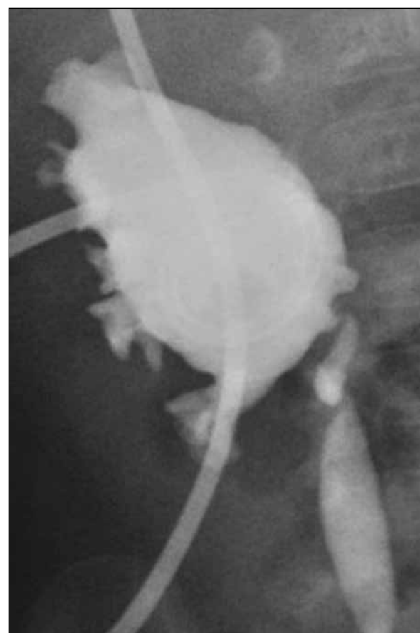
FIG 3. Antegrade pyelogram of the right kidney showing hydronephrosis with narrowing at pelviureteric junction

Pelviureteric junction obstruction is the most common cause of fetal hydronephrosis. Fetal hydronephrosis is defined as renal pelvis dilation