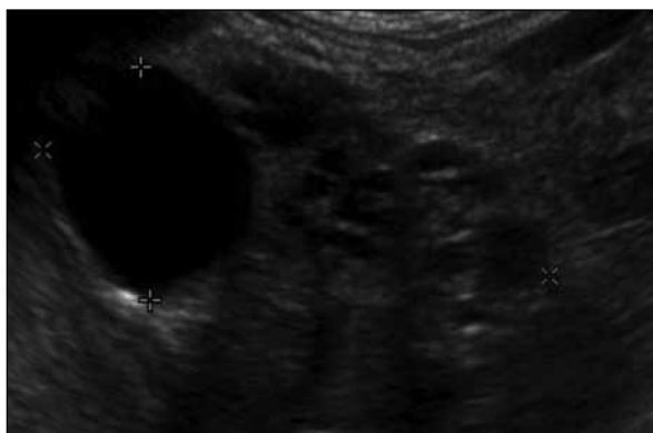
FIG 1. Ultrasonography of the left kidney showing multiple cysts of varying sizes replacing the left kidney, with no communication between the cysts. The largest cyst is peripherally located