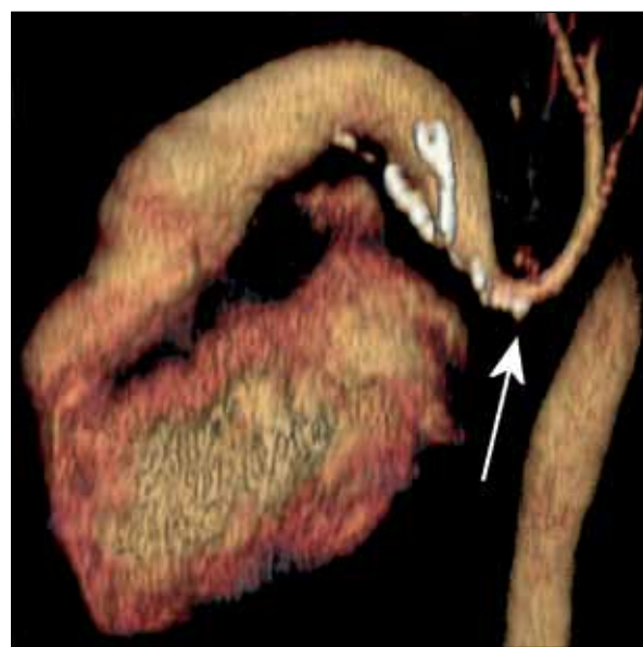
FIG 3. Volume-rendered computed tomographic image from the left side of the patient showing an anticlockwise twist of the left pulmonary artery, centred on the hilum, with a cranial instead of a normal caudal course (arrow)