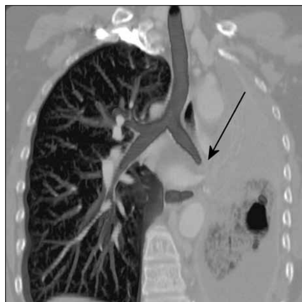
FIG 2. Coronal maximum-intensity projection computed tomographic image showing abrupt termination and complete obstruction of the left lower lobe bronchus at its origin (arrow)

was established and the findings were confirmed at thoracotomy and complete pneumonectomy was performed.