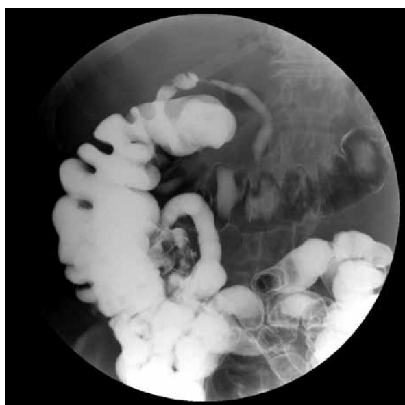
FIG 2. Barium enema showing a fistulous tract between the hepatic flexure and common bile duct