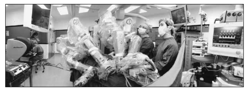
FIG 3. The operating room layout for a typical case of robotic prostatectomy

our patients, as the majority had erectile dysfunction to start with, or the extent of their tumour precluded nerve-sparing surgery. In patients with normal preoperative sexual function and clinically localised small volume disease, we nevertheless generally attempt selective nerve sparing.