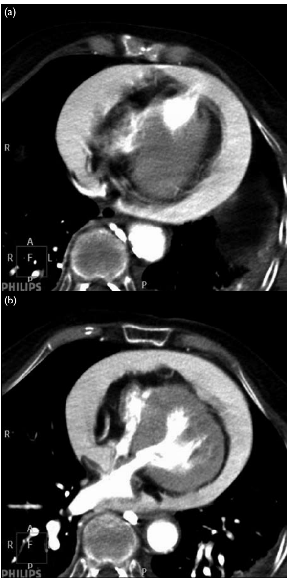
FIG 2. Post-contrast computed tomographic scans (a) revealing ruptured left ventricular free wall with active contrast extravasation, and (b) showing contrast collection in the pericardium with cardiac tamponade

major subgroups: rupture of the papillary muscle, the interventricular septum, and the free wall. Acute rupture of the free wall is the most common type of rupture, comprising more than 50% of all ruptures,1 and accounts for 10% of in-hospital deaths following acute myocardial infarction.<sup>2</sup> Rupture of the papillary muscle and interventricular septum are less frequent, accounting for 8% and 16% respectively. Being female, having hypertension, diabetes, angina, and previous myocardial infarction are all risk factors for ruptured myocardial death, with prolonged and recurrent chest pain being the most frequent and consistent clinical characteristic.1