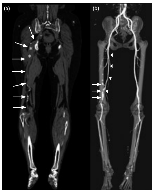
FIG 1. Computed tomographic angiography

(a) A coronal reformatted image showing the right persistent sciatic artery running along the course of the sciatic nerve and giving rise to the popliteal artery (white arrows). Atherosclerotic changes with intra-luminal calcifications are seen distally. A fusiform aneurysm (white *) was noted in the gluteal region. Absence of contrast enhancement was suggestive of thrombosis (b) A volume-rendered technique showing atherosclerotic changes in the distal right persistent sciatic artery (white arrows). The right persistent sciatic artery and aneurysm were not shown clearly due to thrombosis. The right superficial femoral artery (white arrowheads) was hypoplastic compared with the left side