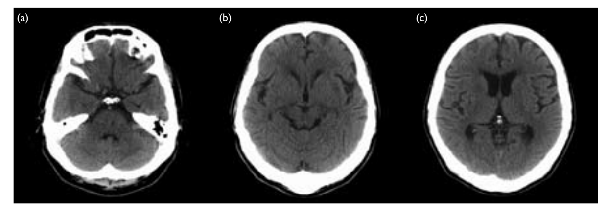
FIG 2. Follow-up computed tomographic scans of the brain at 6 weeks show complete resolution of the pons and midbrain lesions (a, b) with minimal residual changes in the periventricular white matter (c)