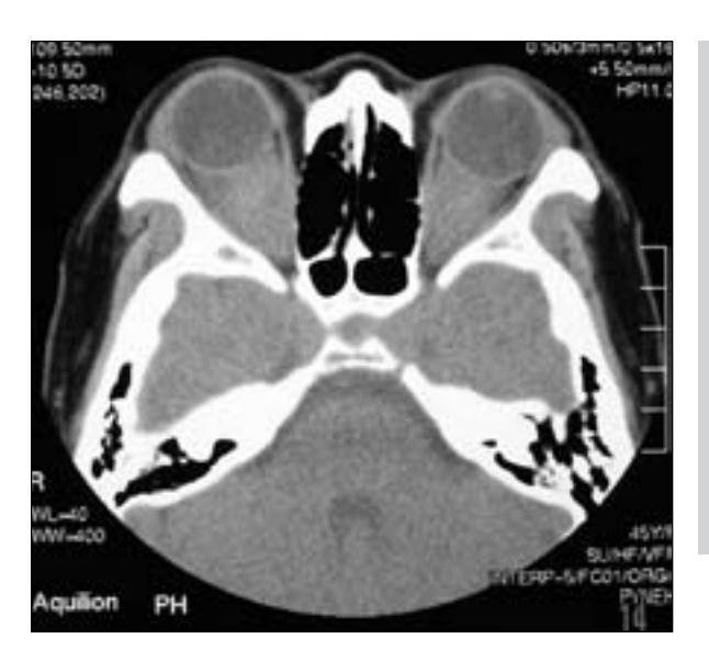
FIG 1. Computed tomography of the brain and orbits with contrast showing bilateral infiltrative intraconal masses

decreased from 6/9 to finger count, and MRI showed an increase in the extent of the xanthogranulomatous lesions. Urgent orbital decompression was performed. Postoperatively, her left visual acuity improved to 6/9, and the disc swelling subsequently decreased. Four months after orbital decompression, she developed a left lower lid entropion, which was corrected surgically.