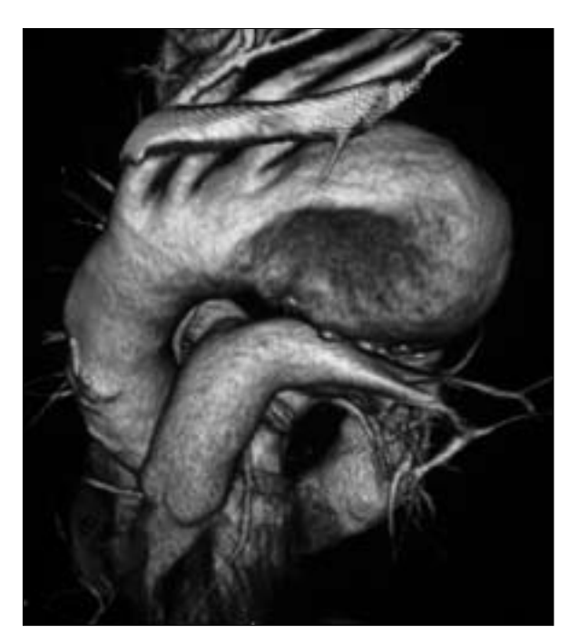
FIG 1. Three-dimensional reconstruction of the computed tomographic arteriogram of the patient's thoracic aorta and the aneurysm

circulatory arrest, and aortic cross clamping. These procedures impose great surgical trauma on patients who are usually elderly and have major medical comorbidities. The mortality rate in emergency open thoracic aneurysm repair varies between 15 and 73%.<sup>2-4</sup>