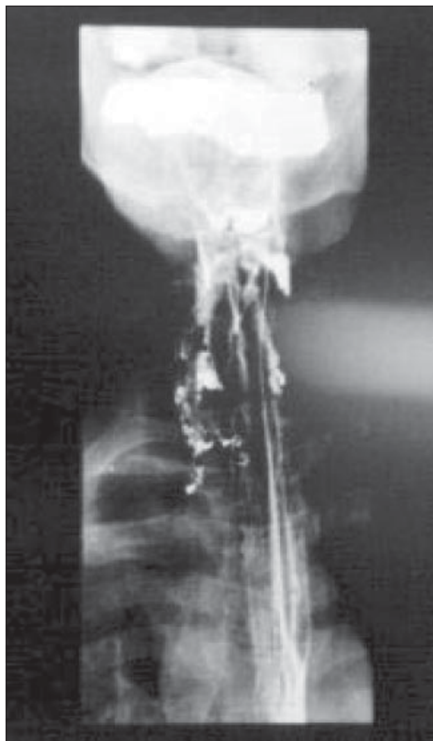
Fig 2. Barium swallow showing multiple tracts along the oesophagus

10 mm are considered positive. A stain for AFB of the pus from the abscess was negative. A culture of tissue homogenate from the abscess cavity for pyogenic bacteria, mycobacteria, and fungal organisms yielded no growth. As all tests, apart from the Mantoux test, were negative for tuberculosis, an enzyme-linked immunosorbent assay (ELISA) for antimicrobial-IgM was used and was found to be reactive at 1:250 dilutions. Further investigation using the ELISA revealed the patient was HIV positive. This was confirmed by a western blot, which tests antibodies against the p24 antigen. The final diagnosis was made about 1 month after presentation. The patient later developed a leak from the tracheostomy site suggestive of a fistula connecting the oropharynx/hypopharynx to the trachea. After insertion of a Ryle's tube, pressure dressings were started. A barium swallow showed multiple tracts from the oropharynx going into the parapharyngeal space (Fig 2). The treatment was changed to anti-tubercular drugs and antiretroviral therapy using zidovudine, lamivudine, and zalcitabine. The patient improved considerably before discharge. He received isoniazid (300 mg), rifampicin (450 mg), pyrazinamide (1500 mg), and ethambutol (1200 mg) for 2 months, followed by isoniazid (300 mg) and rifampicin (450 mg) for 4 months with complete healing of the lesion.