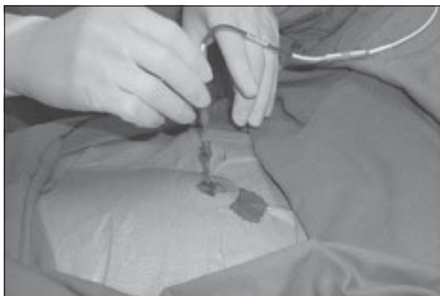
Fig 1. Treatment of an osteoid osteoma of the femur Placement of the radiofrequency probe through the penetration cannula