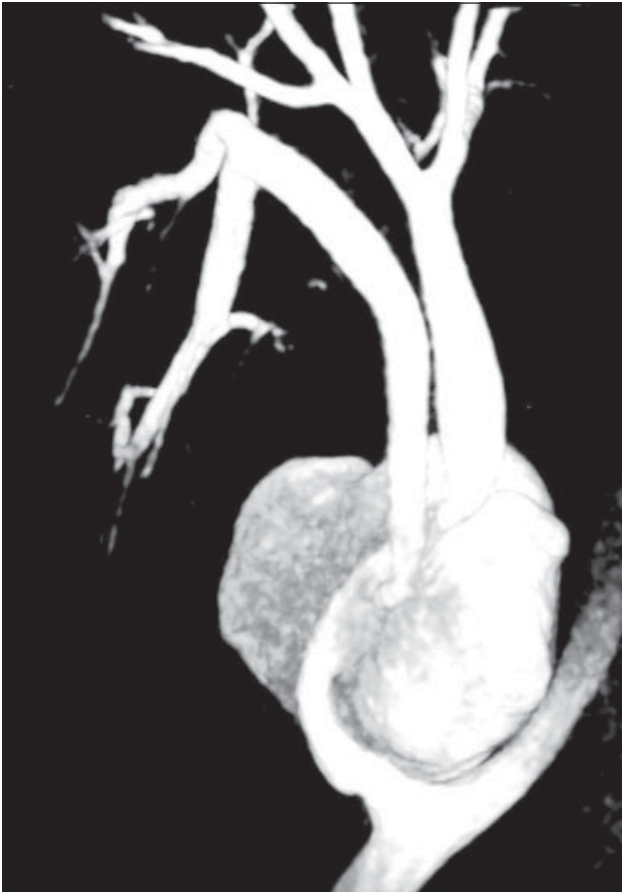
Fig 2. Three-dimensional angiogram with shaded surface display outlining the pseudoaneurysm that was compromising the arterial flow to the renal arterial branches