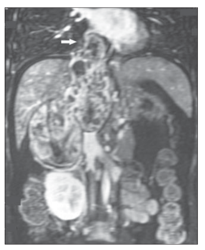
Fig 2. Magnetic resonance image of the abdomen showing right adrenal phaeochromocytoma with tumour thrombus in the inferior vena cava and right atrium (arrow)

Twenty-four—hour urinary assay for fractionated catecholamines showed elevated levels of vanillyl-mandelic acid to 380 µmol/d (reference level, <41 µmol/d), norepinephrine to 7000 nmol/d (reference level, <440 nmol/d), normetanephrine to 25 000 nmol/d (reference level, <240 nmol/d), epinephrine to 9650 nmol/d (reference level, <110 nmol/d), metanephrine to 27 400 nmol/d (reference level, <275 nmol/d), and dopamine to 2450 nmol/d (reference level, <2570 nmol/d). Overnight dexamethasone suppression test was within normal range. Magnetic resonance imaging (Fig 2) and echocardiography confirmed right