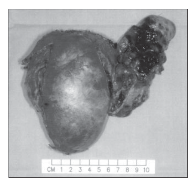
Fig 3. Resected specimen demonstrating a 12 cm x 9 cm right adrenal phaeochromocytoma with a tumour thrombus extending through the adrenal vein and lateral wall of the inferior vena cava into the right atrium

the adrenal vein and lateral wall of inferior vena cava into the right atrium. The right lobe of liver was mobilised anteriorly, and the tumour was dissected from the kidney, liver, and retroperitoneum until it was only attached to the lateral wall of the vena cava at the area of tumour invasion. Median sternotomy was made by the cardiac surgeon. The right femoral vein, inferior mesenteric vein, superior vena cava, and the aorta were cannulated in turn for establishment of cardiopulmonary bypass after systemic heparinisation. The patient was cooled to 23°C before the aorta was cross-clamped, and cold cardioplegia was infused into aortic root to achieve cardiac arrest. The phaeochromocytoma together with its tumour thrombus at the right atrium was then resected en bloc with a cuff of lateral wall of the vena cava (Fig 3), and the resection was facilitated by opening up the right atrium. The right atriotomy was closed and the abdominal vena cava was then repaired with the pericardial flap as patch graft. The patient was weaned off from cardiopulmonary bypass after full re-warming. Aortic occlusion time was 33 minutes and duration of bypass was 123 minutes. The blood pressure remained stable without any episode of hypertensive crisis. The operating time was 11.5 hours with blood loss of approximately 1000 mL. The resected specimen weighed 545 g and histology examination confirmed a diagnosis of phaeochromocytoma with inferior vena cava invasion.