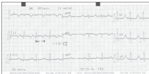
Fig 1. Electrocardiogram of index patient on day 3