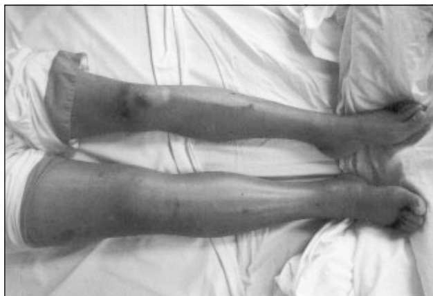
Fig 2. Clinical photograph showing recurrent diabetic muscle infarct involving the thigh muscles

The patient presented again with a painful swollen right thigh 2 weeks later (Fig 2). She had changed the injection site for insulin and erythropoietin to the right thigh following surgery to the left buttock. There was no other trauma. There were no clinical features of compartment syndrome, and deep vein thrombosis was excluded by Doppler ultrasound. Erythrocyte sedimentation rate was 124 mm/h. Serial ultrasound imaging confirmed the same disease process