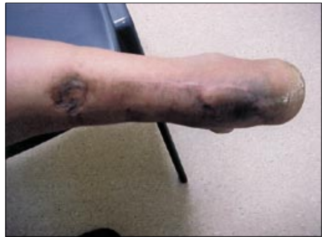
Fig 3. Sural neurovascular flap to repair an ulcer over the Achilles tendon

and a subcutaneous tunnel was created for the passage of the pedicle. Any twisting, kinking, or pressure on the pedicle was avoided during its transfer or tunnelling of the flap. The donor site was either closed primarily or covered with a split-thickness skin graft. The foot and ankle were then immobilised temporarily for approximately 2 weeks in a position that could relieve tension in the fascial pedicle, as well as pressure in the subcutaneous tunnel.