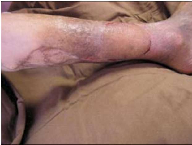
Fig 2. Sural neurovascular flap to repair a lateral malleolar ulcer