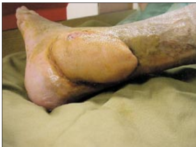
Fig 4. Lateral malleolus ulcer which recurred after a sural neurocutaneous flap, finally covered by a free parascapular flap

wrinkles in the skin flap during the inseting may account for some of the partial losses. Partial loss defects were subsequently covered by direct suturing or with a split-thickness skin grafts.