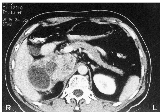
Fig 1. Post-contrast computed tomography scan showing a giant well-defined right adrenal mass (11.0 x 6.6 x 11.0 cm), with possible invasion of the inferior vena cava

phaeochromocytoma of the right adrenal gland. There was also a region of faint uptake of ^{131}\text{I} -MIBG above the dominant mass, which suggested local metastasis. The left adrenal gland, however, did not exhibit any abnormal uptake of ^{131}\text{I} -MIBG.