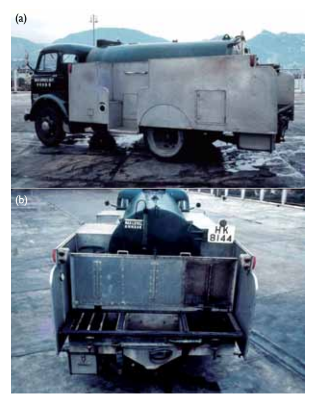
FIG 2. Vehicle designed for night soil collection

In January 1962, the Department of Health began taking samples from the night soil vehicles while they were discharging into the barges. Three to four random samples were taken each week from each vehicle. After a positive sample was first reported, the vehicle was investigated with the object of tracing the infection back to its source. Thus when a sample from a vehicle was positive, each of the loads collected by the vehicle was sampled; when one load was positive, each pail forming that load was sampled. When a pail was found to be positive, the Health Officer took rectal swabs from all the residents in the house or flat in which the latrine was situated. The results of this study enabled the Medical and Health Department to conclude that the 1962 epidemic originated from several sources and that there was a large number of symptomless carriers among the population. Suitable preventive