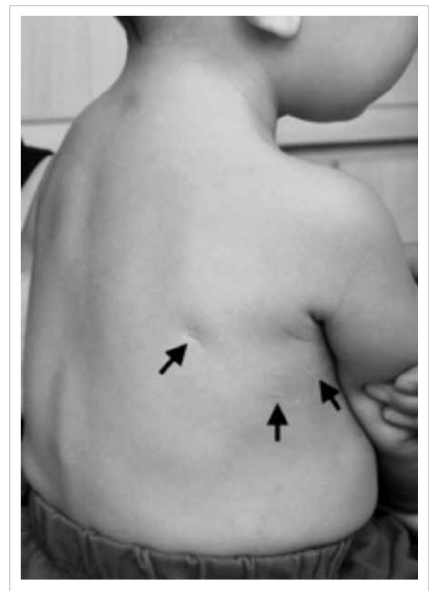
FIG I. A clinical photograph of a child after thoracoscopic operation with minimal scars (arrows)

在過去二十年, 胸腔鏡在小兒外科手術中的使用與日漸增。事實上, 在世界各地一些先進的小兒外科中心內已經可以利用胸腔鏡進行很多 較為困難和複雜的手術,包括肺葉切除術、縱隔腫瘤切除術、修復氣 管食管瘺和膈疝修復。本文簡述胸腔鏡應用在小兒外科手術的歷史及 現況,並討論其潛在優點和所面對的挑戰。