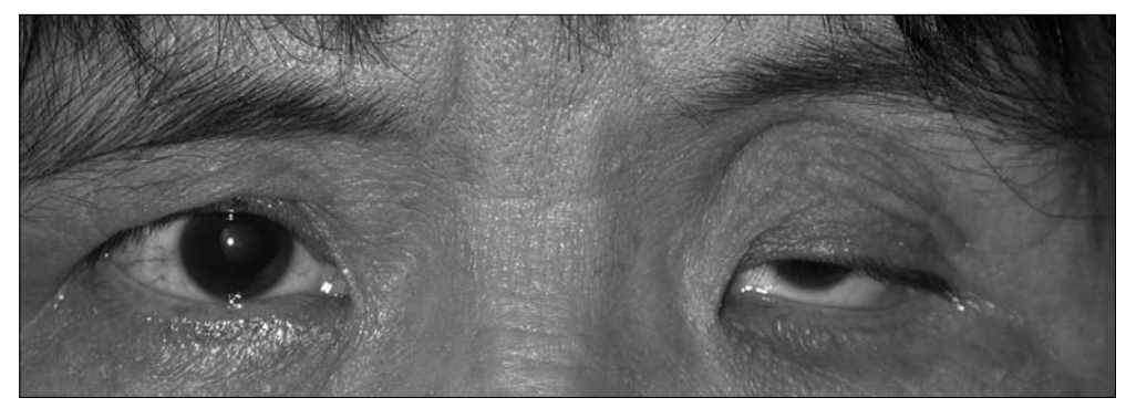
FIG 1. Left eye enophthalmos and pseudoptosis