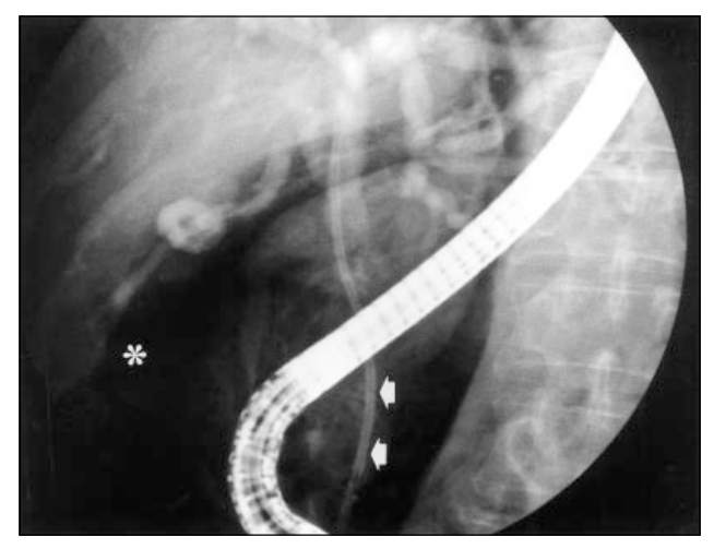
Fig 2. Radiographic film of the patient after endoscopic retrograde cholangiopancreatography and biliary stent insertion

The radiographic signs of retroperitoneal air or free intraperitoneal air should be sought on films taken after ERCP if a perforation is suspected. Computed tomographic (CT) scan viewed in the appropriate window settings would be a more sensitive method to look for retroperitoneal or intra-abdominal collections (Fig 3). When in doubt, water-soluble contrast examination of the upper gastrointestinal tract can be performed. Most of these collections cannot be drained adequately by percutaneous procedures under imaging guidance.<sup>3</sup>