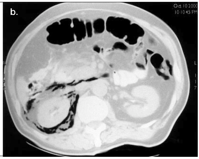
Fig 3. Axial computed tomographic scan images at the upper abdominal level in another patient with duodenal perforation after endoscopic retrograde cholangiopancreatography

(a) at a window width and level setting that is optimal for soft tissue visualisation, the kidneys and the second part of the duodenum can be seen. The retroperitoneal air (arrow) is hypodense to the retroperitoneal fat which, in turn, is hypodense to the soft tissues (viscera and muscles); (b) at a lung window setting, the air collection stands out and can be differentiated readily from pararenal fat. Paraduodenal collection is absent