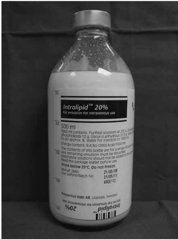
FIG 2. Intralipid 20% (Fresenius Kabi AB, Uppsala, Sweden)

reaction, fluid overload, impaired liver function, hypercoagulability and pancreatitis. To date however, no such severe complications have been associated with lipid emulsion therapy. It has therefore been recommended that 1000 mL of 20% lipid emulsion should be available in clinical areas where treatment of LAST might become necessary. 13,15,24,25 In our hospital, Intralipid 20% (Fig 2) is available in the operating theatres and the obstetric labour room.