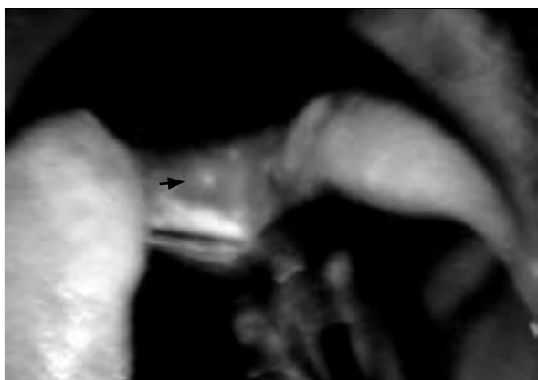
FIG 1. Photograph of the oral cavity showing the tuberculoma type tuberculous glossitis lesion at the dorsal surface near the base of the tongue