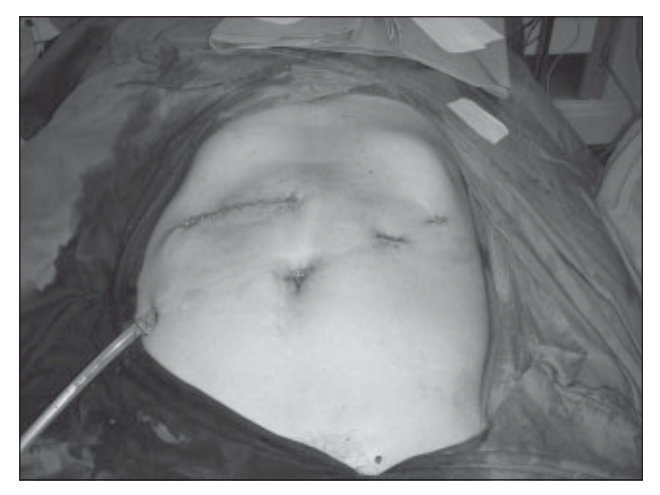
Fig 2. Wounds visible after completion of laparoscopic liver resection

can lead to fatal air embolism and must be cautiously avoided. In our series the only conversion to laparotomy was secondary to bleeding from the left hepatic vein with evidence of air embolism; the 'laparoscopic hand' provided immediate haemostasis before proceeding further. Another measure to minimise air embolism is to maintain insufflation pressure as low as possible (preferably <10 mm Hg) or to apply the abdominal-lift method as in gasless laparoscopy. Throughout the operation, the patient's vital parameters and end tidal CO<sub>2</sub> level should be closely monitored.